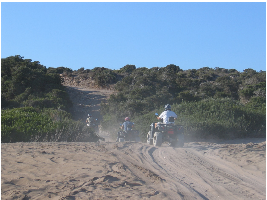
Illegal off-road driving at Lara