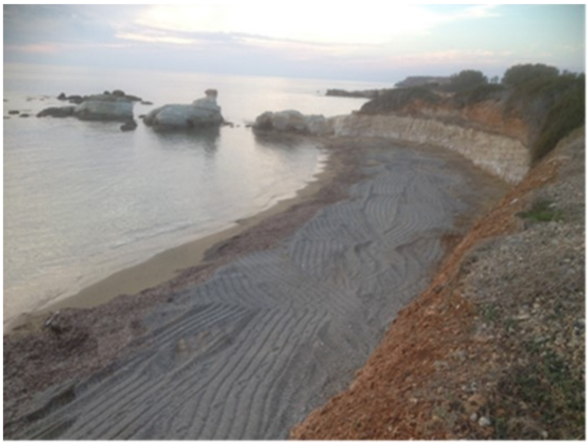
Illegal beach alteration at Kafizis beach