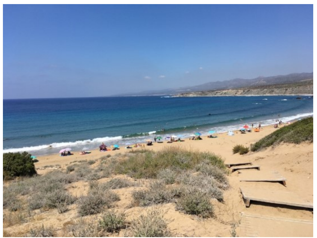
Illegal use of beach umbrellas in North Lara