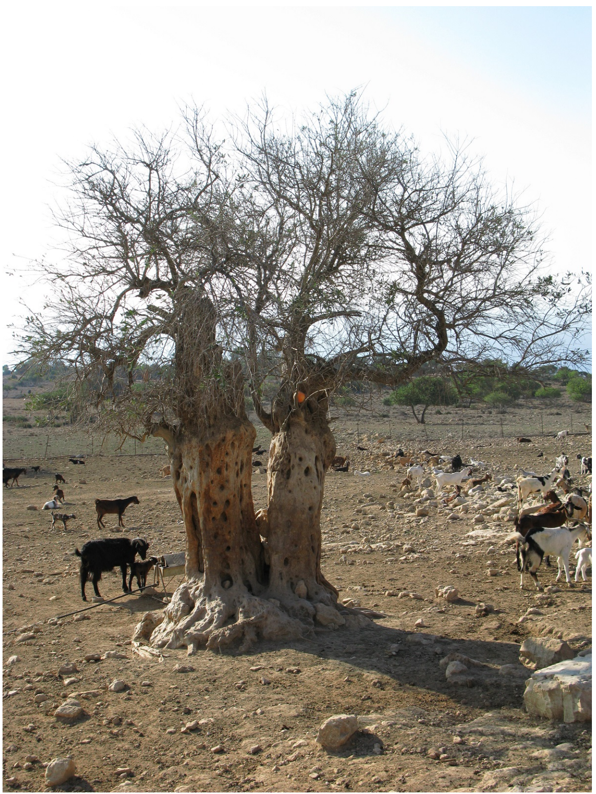
Uncontrolled grazing at Akamas