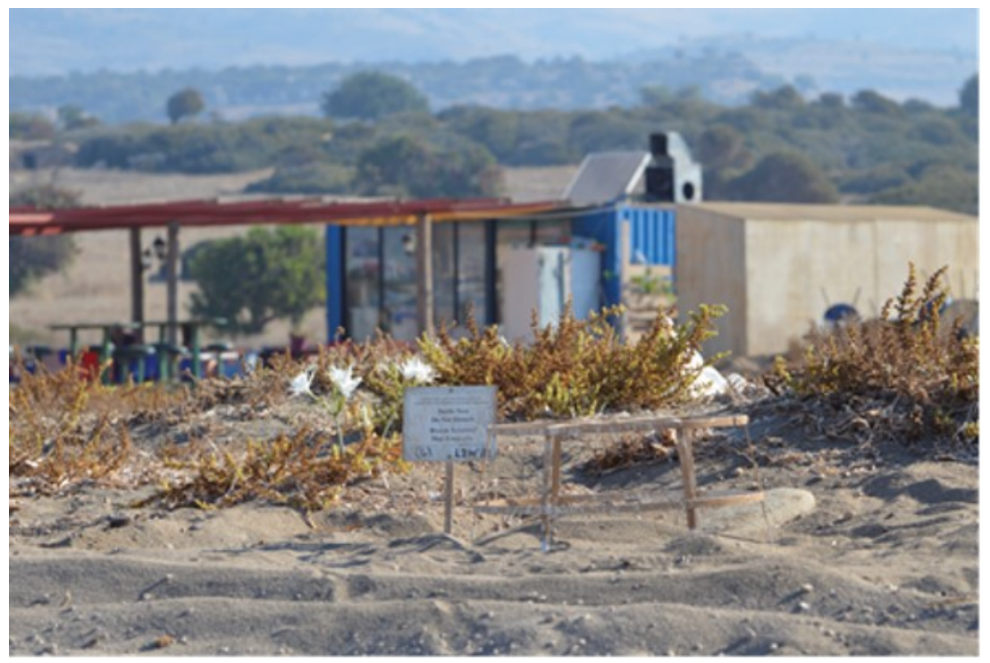
Illegal refreshment stall at South Lara