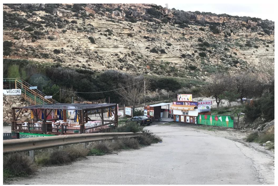
Illegal refreshment stall at Aspros Potamos