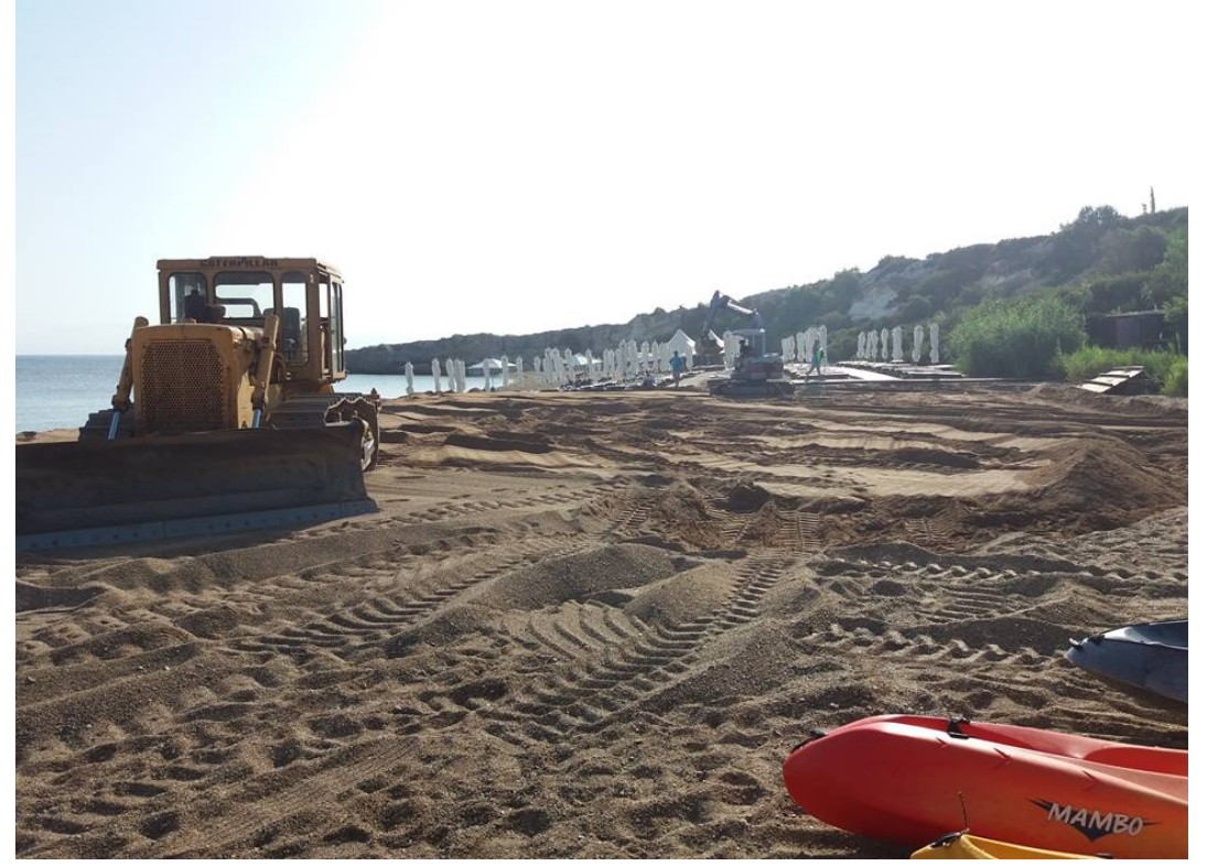
Illegal beach intervention at Asprokremmos