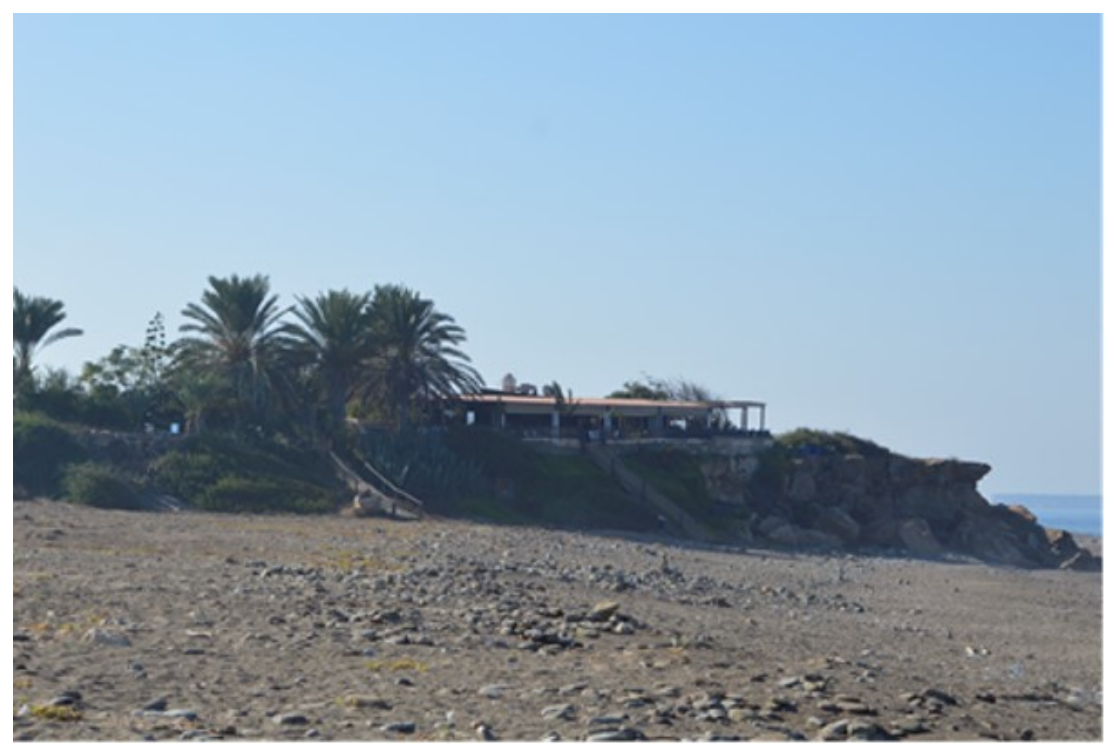
Illegal restaurant at South Lara

The photographs that follow show illegalities that continue to exist in the area: